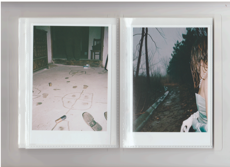
Entropy is unavoidable (en collaboration avec Igor Dubreucq)